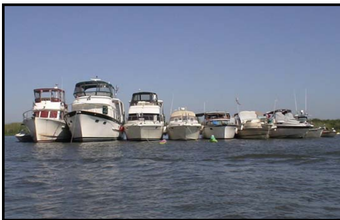
July 4th raft-up at Three Mile Slough